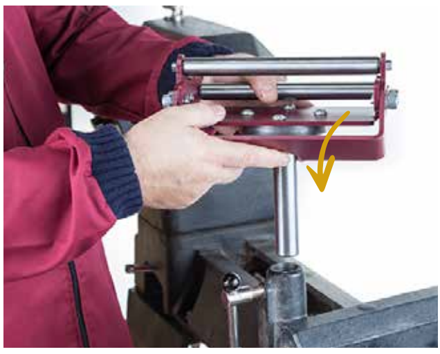
Insert the stem into the lathe banjo