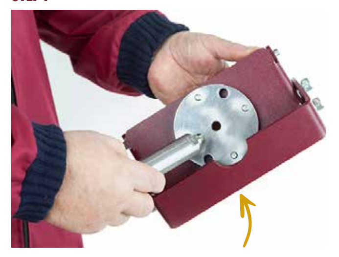
Turn the SteadyPro over to access the stem fitting location