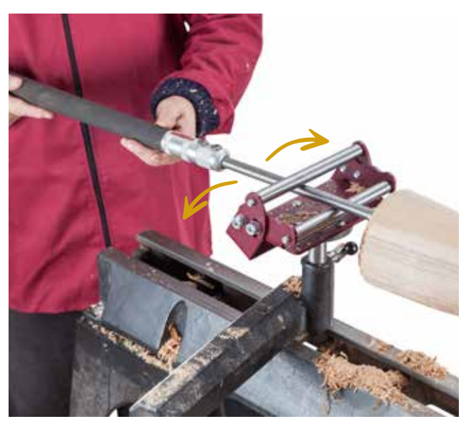
The rollers allow the user to move the tool lightly from left and right whilst being held securely