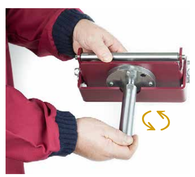
Screw the stem into the base of the SteadyPro and lock into position